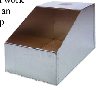
Commercial Nest Box

heat and moisture to escape. If you use a metal box, use one with a removable wooden bottom. Metal floors are cold and slippery. Metal floors contribute to chilling of the litter and spraddle legs. Don't use them.