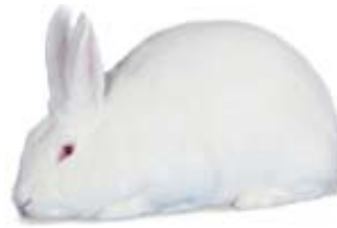
New Zealand White

Cals and New Zealands (Whites) are the leading favorites and by far produce the greatest number of winning pens. For those who like something a little different, Pals and Satins come in a close second. They have an advantage in eye appeal, but they do tend to grow a tad slower, so if you choose these breeds, you will definitely want to shoot for 10 week-old fryers on weigh-in day.